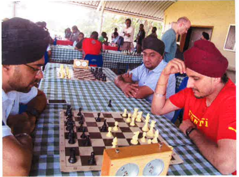
RYA officials try out a game of chess!