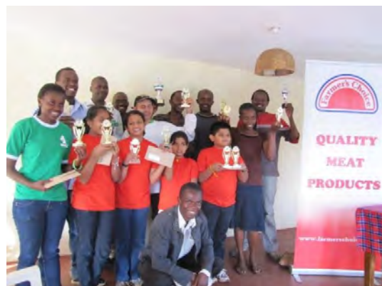
(Prize winners hold their glittering trophies)

Farmer's Choice Ltd provided gift vouchers worth 20,000 which were distributed to prize winners and others.